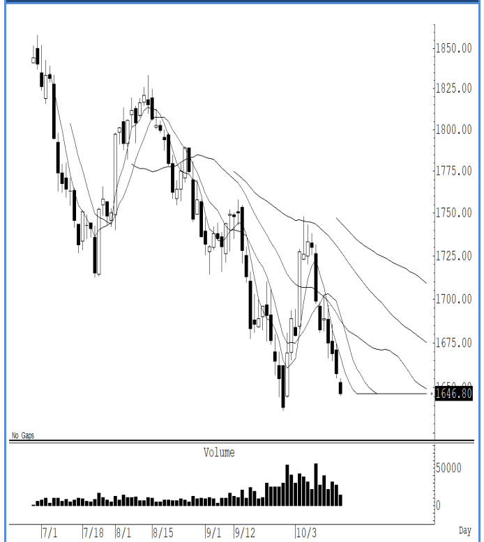
GOZ22 (Close 1,646.80 Chg -11.0)

ราคาทองคำโลกปรับตัวลงมาใกล้จุดต่ำเดิมอีกครั้ง ต้องระวังทำจุดต่ำใหม่ สั้น ๆ ไม่ต่ำกว่าแนวรับแถว ๆ 1,630 ดอลลาร์ แนะนำ trading ในกรอบ ระหว่าง 1,630-1,685 ดอลลาร์ รับรู้กำไร ในกรณีที่ปิดต่ำกว่าระดับ 1,630 ดอลลาร์ แนะนำ ถือ short หวังผลปรับตัวลงไปแถว ๆ 1,580 ดอลลาร์ รับรู้ กำไร